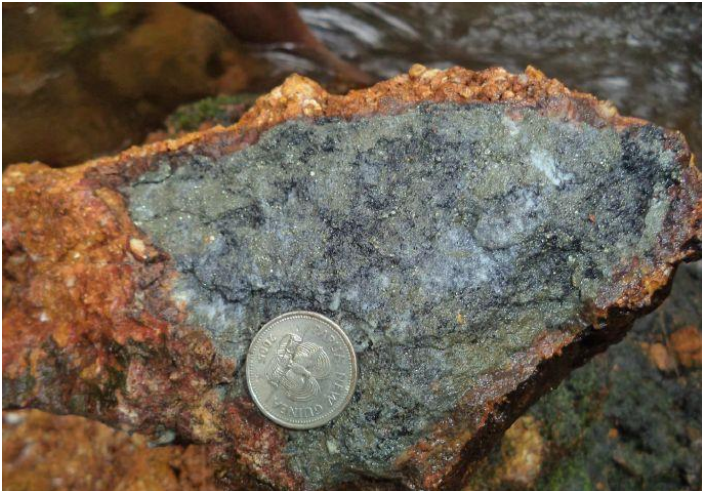
Figure 2: Silica + clay + pyrite + chalcocite altered volcanic from Nakru 4 prospect

All of the samples with elevated copper contain sulphides with little or no oxidation. The dominant sulphides are pyrite and secondary chalcocite with some chalcopyrite (Figure 2). The float samples are considered to have a local provenance as the topography is relatively subdued limiting downslope movement and the samples are relatively unoxidised suggesting recent exhumation. The sulphide mineralisation is associated with strongly developed silica + sericite + clay altered rho-dacite breccias. Similar rocks host mineralisation at Nakru 1 and Nakru 2 prospects.